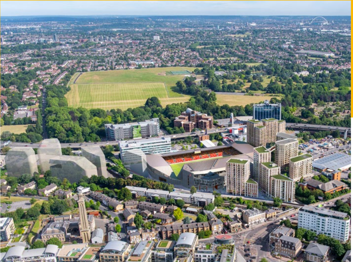
Latest computer generated image of the Brentford Community Stadium development

Welcome to this second edition of the Brentford Community Stadium construction newsletter, providing an update on work at Lionel Road South and a preview of the months ahead.