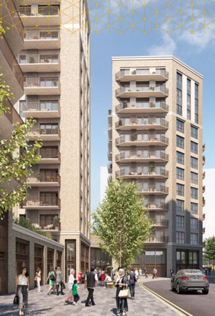
Latest computer generated image of Capital Court towards the East Bridge